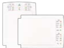
K10V/K10H 10-Zone LED Keypad