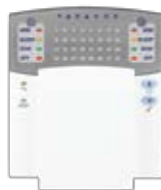
K32 32-Zone LED Keypad