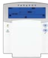
K32I 32-Zone Fixed LCD Keypad