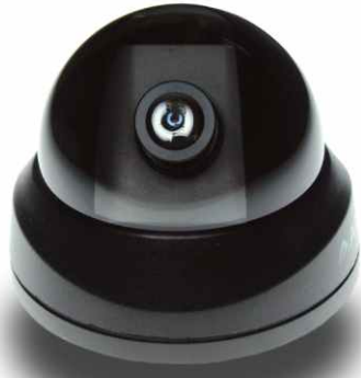
AD-02 PROFESSIONAL SERIES